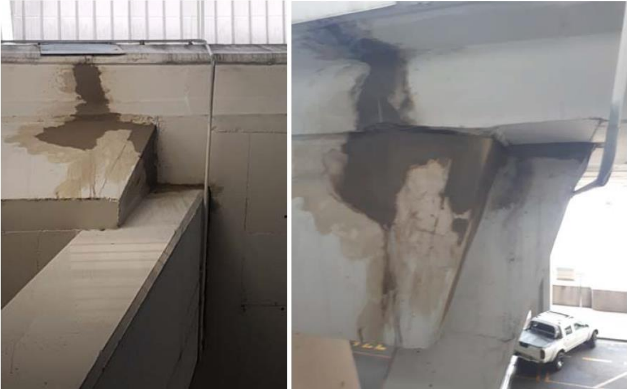
Plastered expansion gaps on pillar 23.