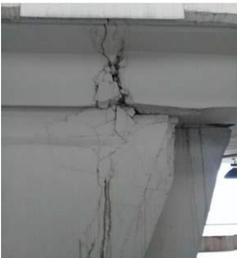
Image of pillar 23 as reported on 28 January 2019.

The defects were classified by the structural engineer as cracking of the mortar inside the bridge expansion gap.